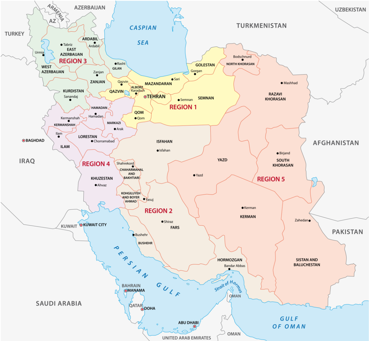
Map 1. Iran 3